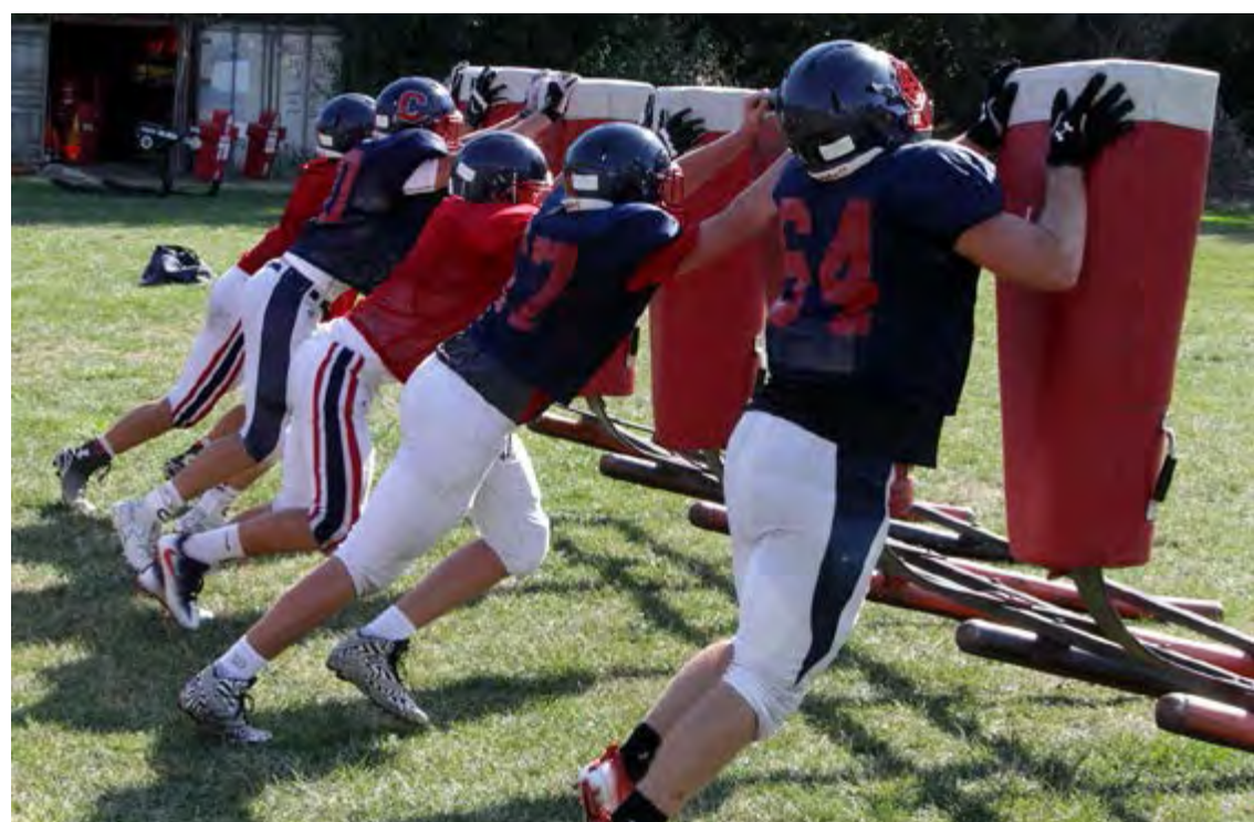
The Campolindo Cougars hope to repeat their championship ways.