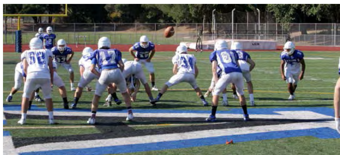
The Acalanes Dons will lean heavily on their defense.