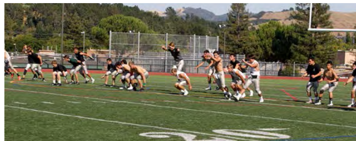
The Miramonte Matadors football team gets into shape for the new season.